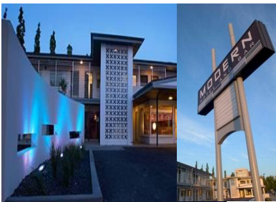
Modern Hotel 1314 W. Grove

Parking for Saturday Morning (park near the West End of the Capitol)