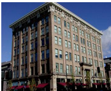
Empire Bldg. 204 West 10 th St.