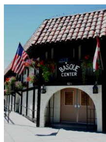
Basque Ctr 611 Grove