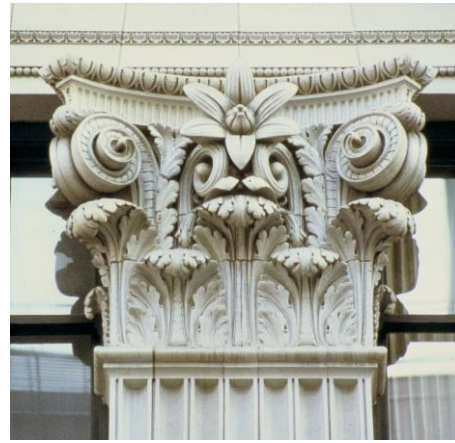
United States National Bank (1916/1925). 321 SW 6 th Ave.