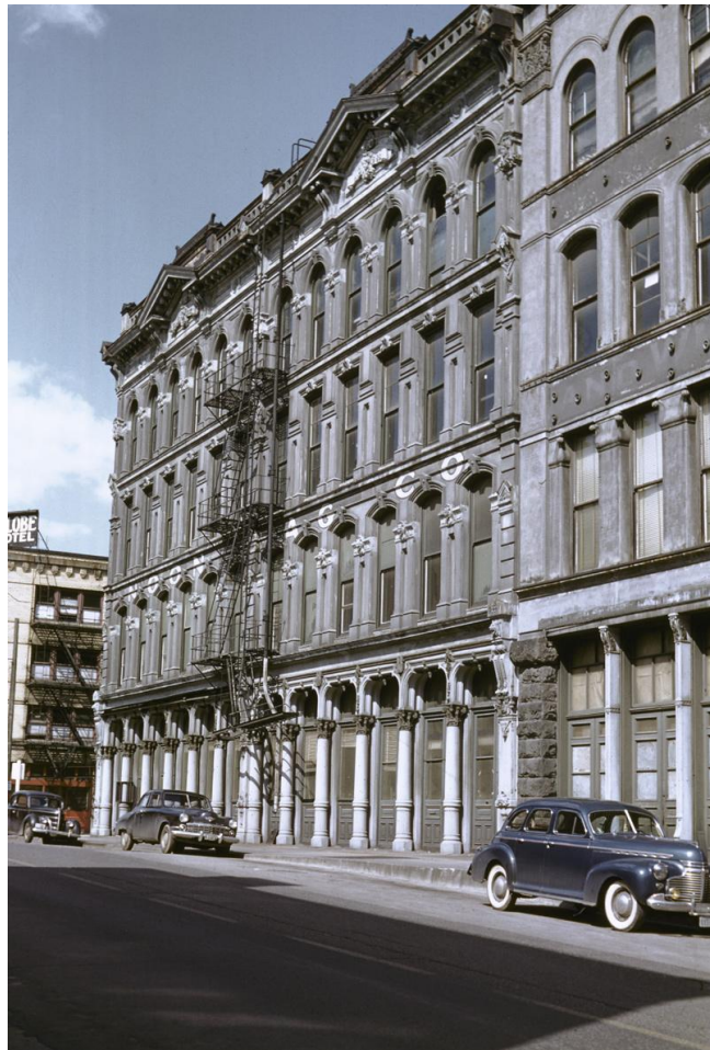
Blagen & Skidmore Buildings.